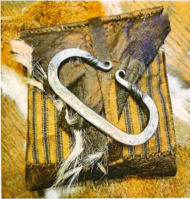
A frontier style fire steel and bag crafted by Jeff Luke.