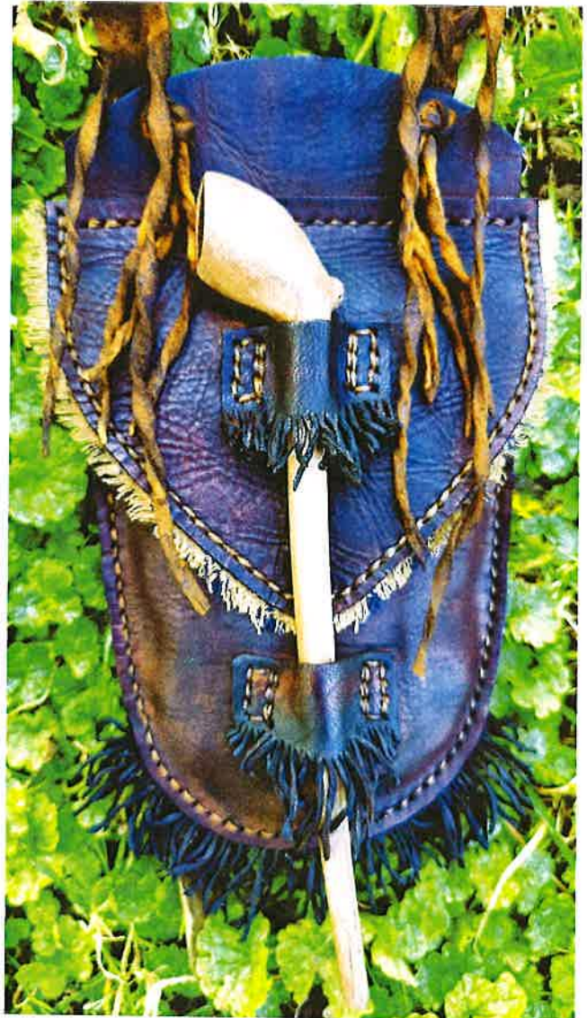
A frontier style smoking bag crafted by Jeff Luke.