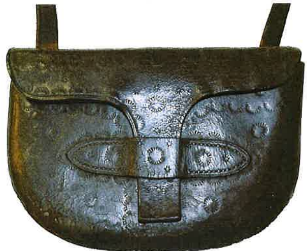
Detail from mid-19th century Ohio shooting pouch with stamped decoration