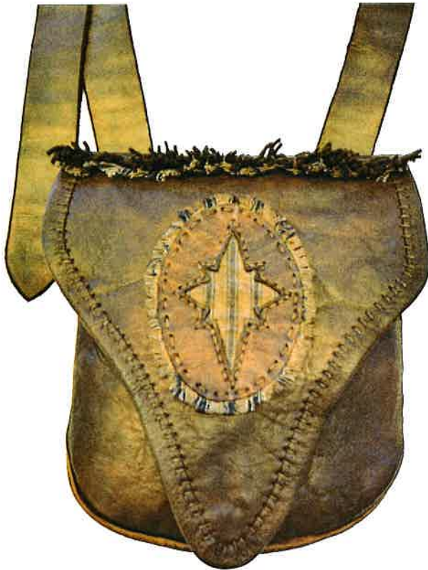
A frontier style shooting pouch crafted by Jeff Luke.