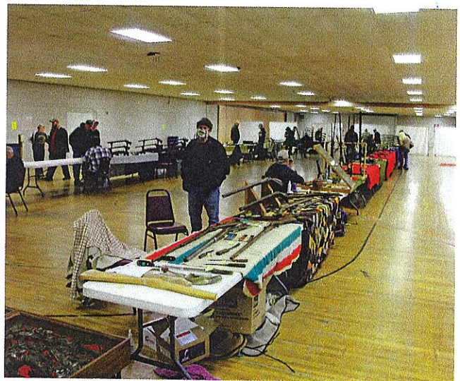
Image of the Au 2020 Ashland exhibit, trade, and sell show during the COVID-19 Pandemic.