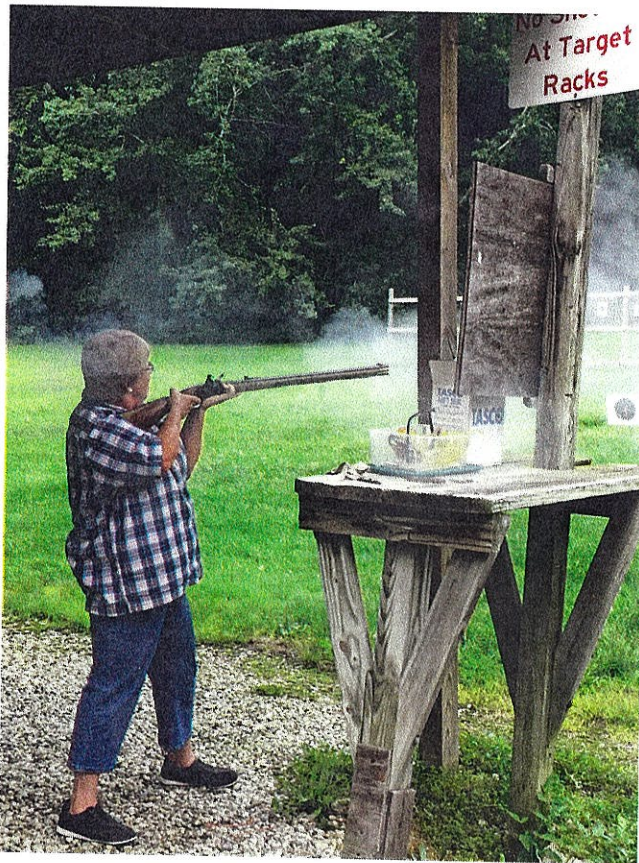
A flintlock speaks! Attendees at the August 11th Picnic had a wonderful time!

Well folks, another Marietta show came and went. As usual, the tables were full of the finest rifles produced in our country. The weather was almost too nice. At the banquet, the members present voted to bring our constitution and bylaws up to state minimum standards. The originals, done in 1984, were left in place but brought "up to code." Don't forget, if you made